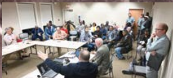
Residents in Andrews, above, and Pawleys Island, below, told the commission their needs had been ignored in the past.

Georgetown County voters narrowly passed a 1-cent capital project sales tax to fund infrastructure projects.